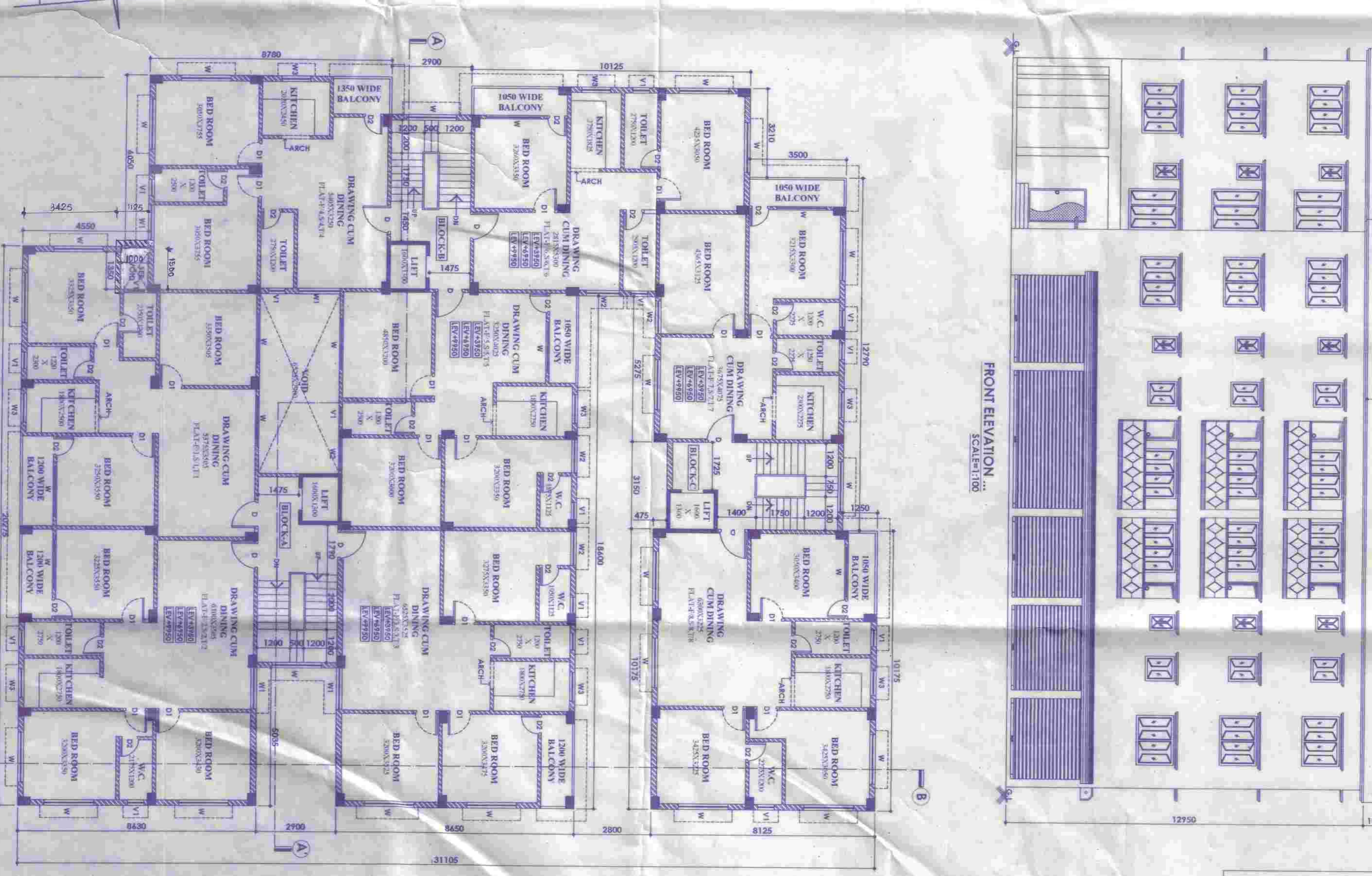
FIRST, SECOND & THIRD FLOOR PLAN ... SCALE=1:100